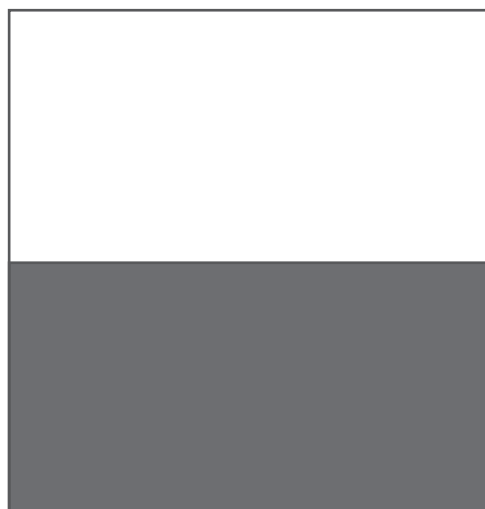
Half Page - $250