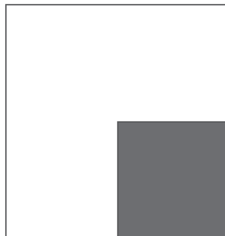
Quarter Page - $100